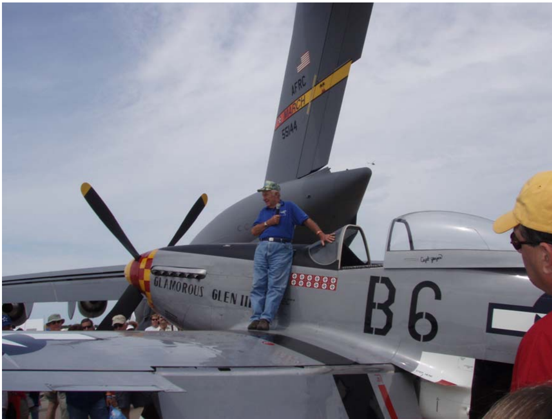
An Aviation Icon – Chuck Yeager

For more events go to www.eaa.org/events Or www.flyins.com